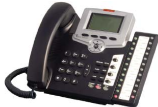
T200 Series (SIP/MGCP)