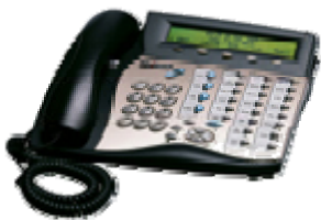
FlexSet IP (MGCP)

The Green Pearl supports a wide range of proprietary and SIP compliant IP desk top telephones, softphones and WiFi telephones. The Tadiran IP terminal range and protocols include: